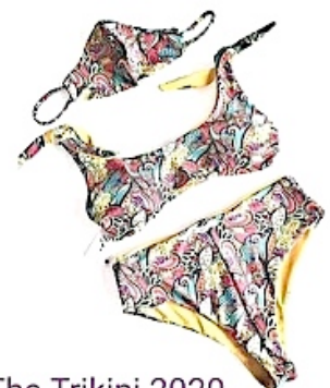
The Trikini 2020